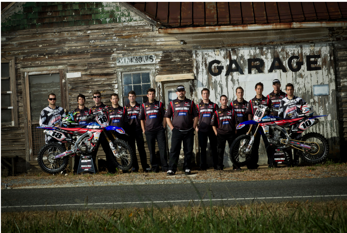
The Muscle Milk/Toyota/JGRMX Team