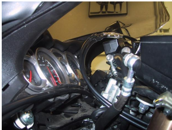
Cables are in front of the triple clamp and over the bar and master