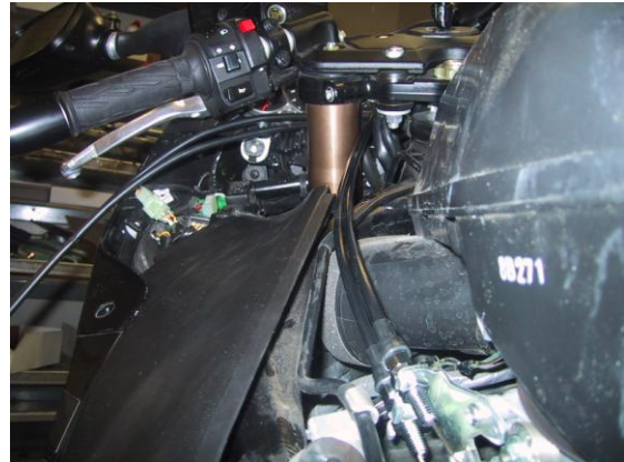
Route the cables between the fork and the frame.